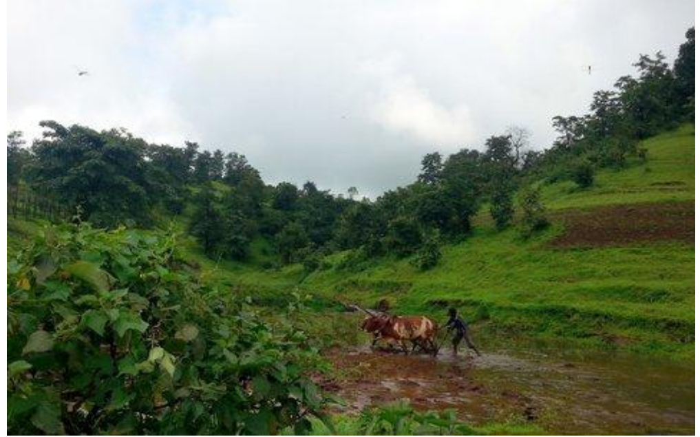
Encroachment in Tanks

Need for Removal of Encroachment in Tank Irrigation System: Assuring timely irrigation by proper use of available of water by adopting efficient ground water recharge compounds, judicious people involvement cleaning and rejuvenating of rural tanks and adopting appropriate changing cropping pattern based on water availability.