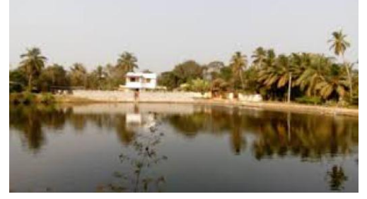
Encroachment in Tank-bed Area

The fall in-efficiency of the tank system could be one or more reasons. The major challenges faced in storing rainwater in the tanks up to their designed capacity, is the encroachments being made along the supply and surplus channels and tank water spread areas. Such encroachments constrain the carrying capacity of the channels resulting in only partial inflow of runoff into tanks from their catchment areas. The encroachments also induce the encroachers to willfully break the surplus weirs or tank bunds in order to protect their standing crops in the encroached tank bed area from damage.