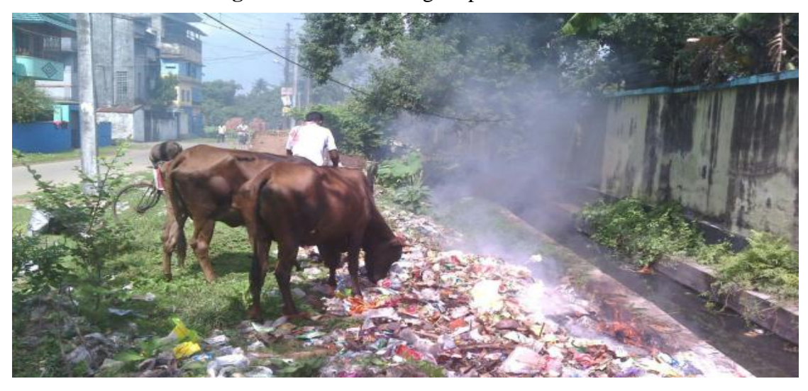
Figure-6: E-wastes – a very fast growing problem to be dealt with.