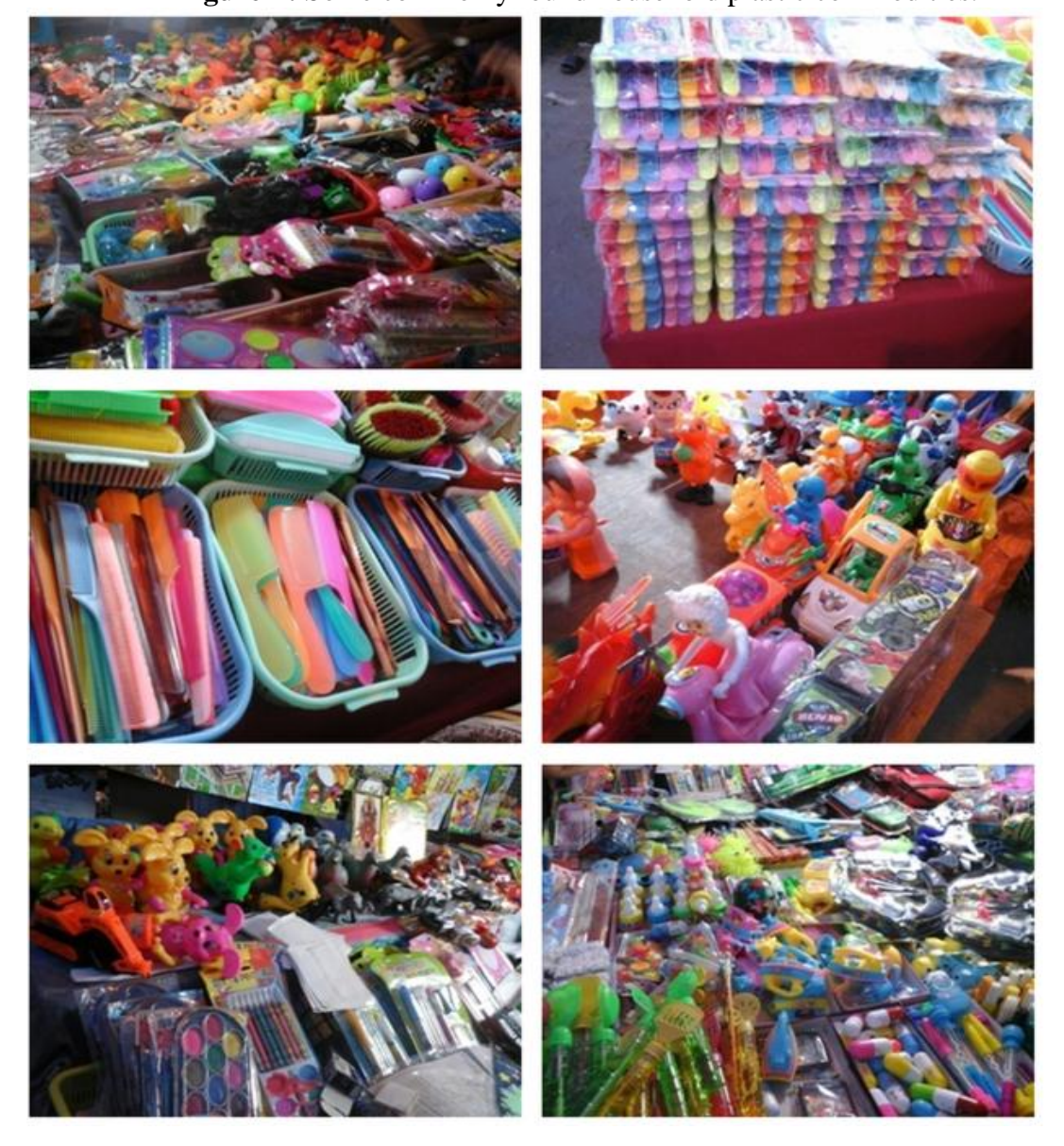
Figure-1: Some commonly found household plastic commodities.