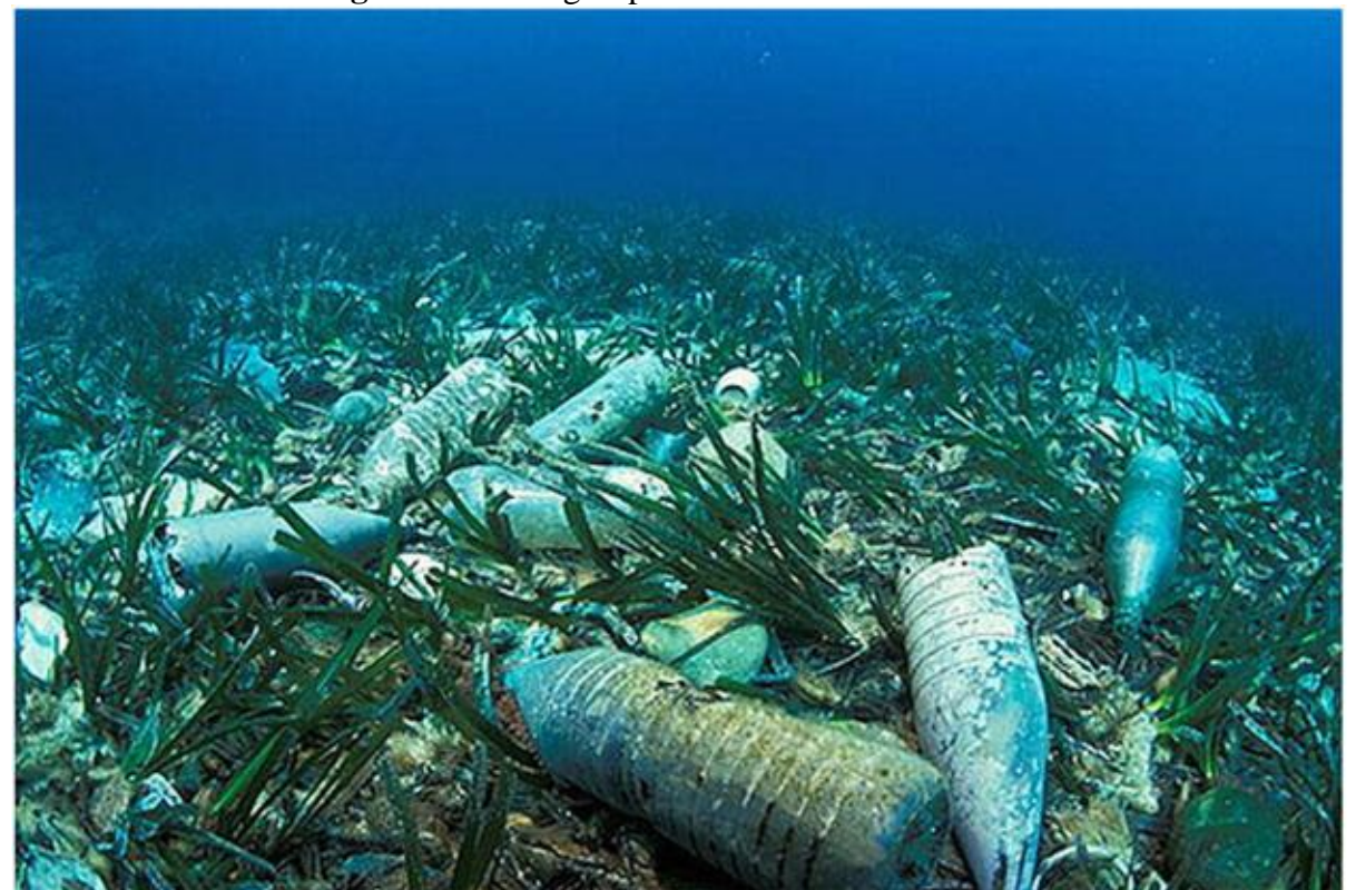
Figure-4: Settling of plastic wastes on sea floor.