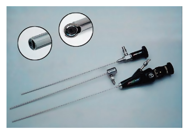
Fig.1: Two soft malleable fiberoptic microhysteroscopes with diameter of 2-mm used. The upper part is a telescope with operative channel of 0-degree and diameter of 2-mm. The lower part is a telescope with operative channel of 30-degree and diameter of 2-mm. The middle part includes the diagnostic sheath of the microhysteroscopic telescope.

Recanalization was performed during the early follicular phase of the menstrual cycle. The women were instructed to take one gram of azithromycin orally (Amoun, Egypt) before the procedure as an antibiotic prophylaxis, and 75 mg of diclofenac (Pharco, Egypt) was given intramuscularly on the day of recanalization, as an intra-operative analgesia. The women undergoing UGTR were placed in the lithotomy position with a partially full bladder in order to straighten the uterus. The cervix was exposed and the entire vagina was cleaned with betadine and draped. A Cook catheter (Cook South East Asia Pte Ltd., Singapore) was applied as in figure 1.