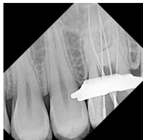
Figure 2. Working Length Radiograph.