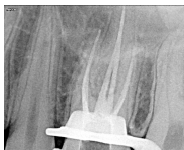
Figure 4. Immediate Obturation Radiograph.