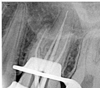
Figure 3. Mastercone Radiograph.