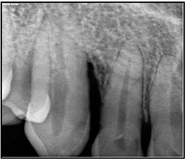
Fig 2a: Control site IOPA at baseline.

Fig 1b: Experimental site IOPA after 12 months.