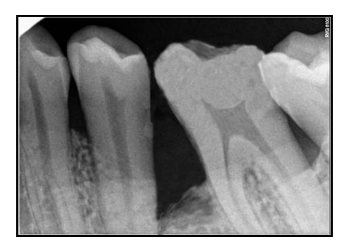
Fig 1a: Experimental site IOPA at baseline.