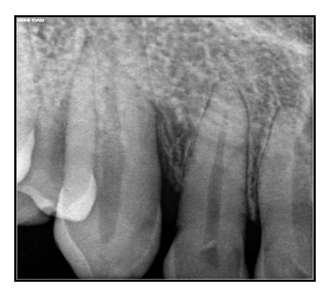
Fig 2b: Control site IOPA after 12 months.

Fig 1a: Experimental site IOPA at baseline.