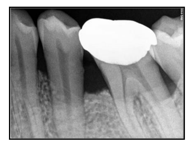
Fig 1b: Experimental site IOPA after 12 months.

Graph 2: Comparison of percentage of bone fill in experimental and control group.