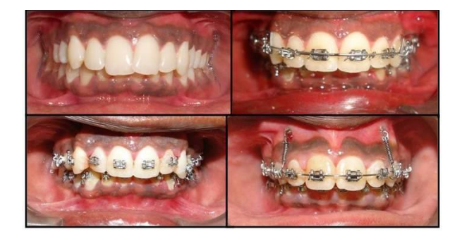
Fig 2: Pre operative and post operative photograph.

Fig 1: Two conventional lateral cephalometric head films of the patients.