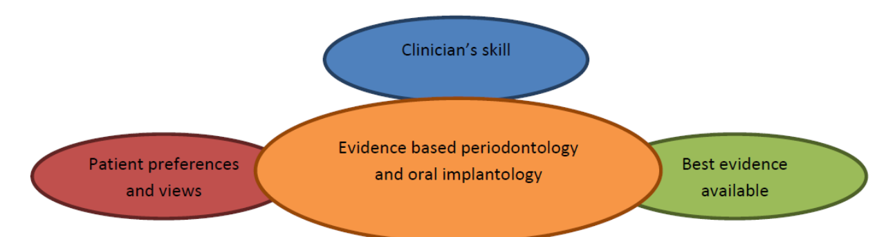
Fig 1: Relationship of clinical skills, the patient and the 'evidence' to evidence based periodontology.