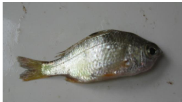
Fig. 1: Gerres oblongus (Cuvier)