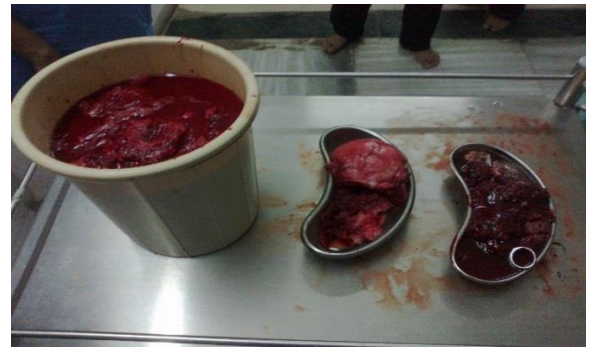
Fig. 2: Total blood loss during surgery