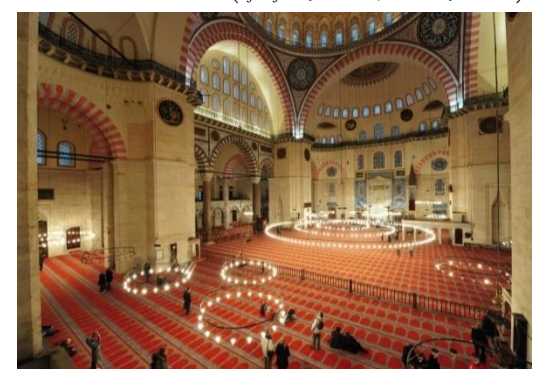
Figure 3. An External and Interior View of Suleymaniye Mosque

16th century was accepted as the most powerful period of the Ottoman Empire in all fields (İnalcık, 1994). He became the chief architect in this period and he used this power to put Ottoman architecture over the top. On the other hand the Ottoman Palace and