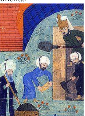
Figure 2. A Miniature to Show the Construction of Suleyman the Magnificient's Tomb by Sinan

figure in the architectural field (Refik, 2012). Lutfi Pasha wanted to build 3 galiots to pass the Lake Van from Sekban Sinan. After he completed this duty successfully, he became Subaşı a position in the Ottoman Army (Refik, 2012).