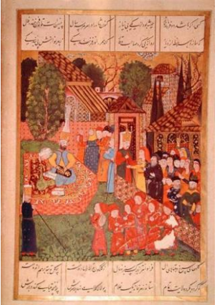
Figure 2. Miniature to Show the Ottoman Devshirme System

On the other hand, the Ottoman State had to find new soldiers because of new conquests. According to Carsili (1984) the Seljukids used the prisoners of war to fulfill the need in the military field by using the pençik law. In the same manner also the Ottomans used the prisoners of war by using devshirme law. Especially by the advices of Çandarlı Halil and Molla Rüstem the non-muslim kids between 8 and 20 years old were gathered for training. These kids were given to a Muslim family to teach Turkish customs during 3 to 8 years. (Pakalın, 1983; Neşri, 1987).