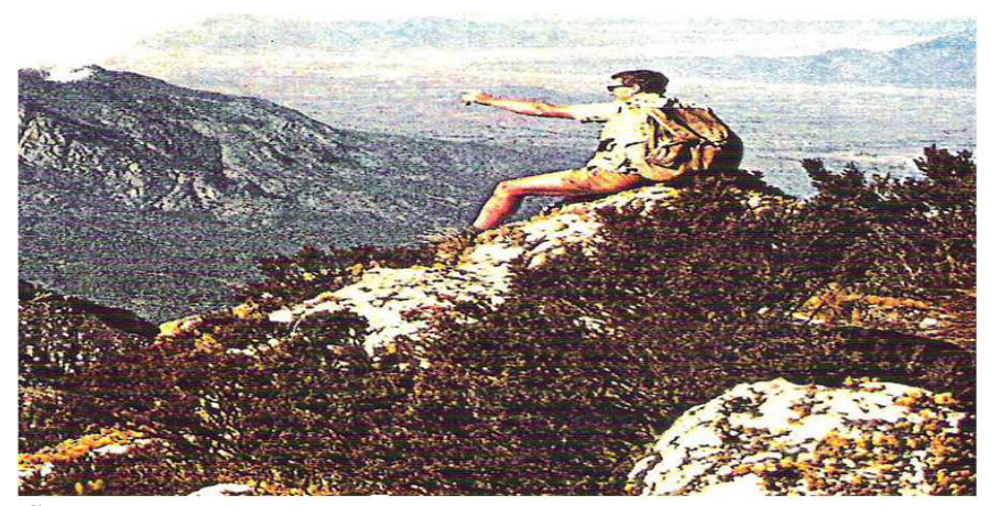
Photograph 3: Showing Rock out Crop Due to Denudation Attributed to Tourist Activities (Backpacker or Tourist on it) as can be Seen on the Photograph