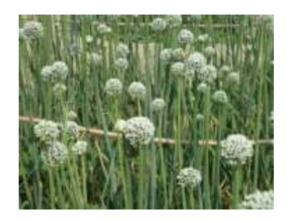
T<sub>5</sub>= T<sub>1</sub>+Dhaincha 5 t/ha