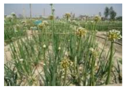
T<sub>6</sub>= Control (No manures and fertilizer)