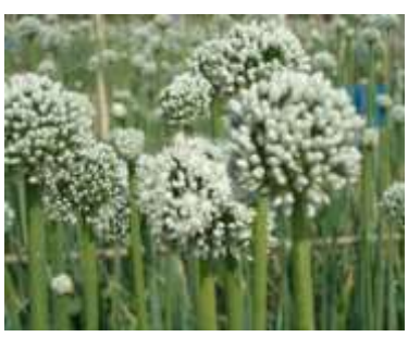
T_2 {= T_1 + Cowdung \ 7.5 \ t/ha}