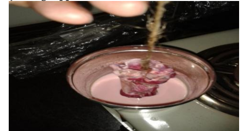
Fig. 3 After 2 hours boiling