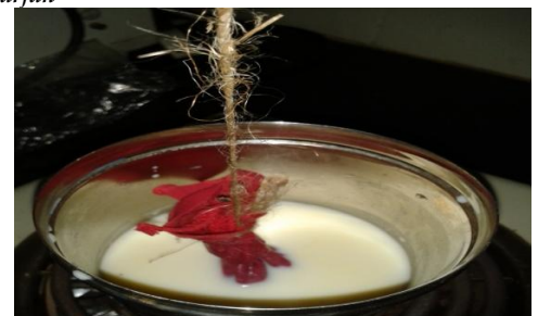
Fig. 2 Marjan Bag dipped in milk