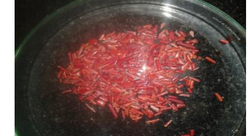
Fig. 1 Marjan

The Differential Scanning Calorimetric analysis was performed using TA-DSC Q 200 V 24.10 build 122. Thermograms were analyzed with TA universal analysis NT software. <sup>[14]</sup>