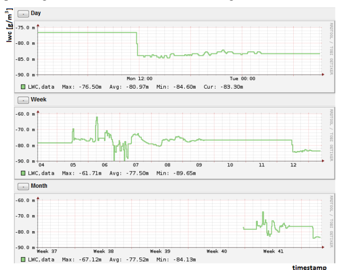
Fig. 5. Graphical representation of each considered atmospheric parameter in time (daily, weekly and monthly).

Each measured parameter has automatically charts generated (four time windows - per day, per week, per month and per year). These charts (see Fig. 5) will come up when pressing a chart icon as it can be seen in Fig. 4.