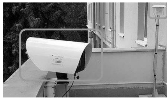
Fig. 1. Free Space Optics head (model Light Point – Flight Strata 155) on the left. Fog sensor with ability of measuring different atmosphere paramteres (temperature, humidity, preassure, altitude, lwc). This setup is located within a campus of Technical University of Kosice (Vysokoskolska 4).

Many papers, real measurements and theory have agreed that fog – as one of the atmospheric effects – lowers the receiving optical signal at both FSO nodes. Optical signal gets mostly scattered at fog particles in the air. There is no way how to suppress this fog appearance. However, it's essential to know when the fog will most likely be formed. That's why it's reasonable to find the way to measure particle concentration in atmosphere. More importantly it's quite tricky to use a proper method to process gathered data in order to make FSO link working with high availability and reliability. Fog sensor is measuring so called LWC parameter in [g/m^3] (Fig. 1).