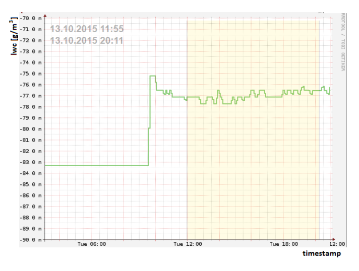
Fig. 6. Graphical representation of each considered atmospheric parameter in time (daily, weekly and monthly).

Weekly LWC record is shown in Fig. 6. LWC parameter fluctuates quite rapidly when atmosphere conditions changing as it can be seen from this figure.