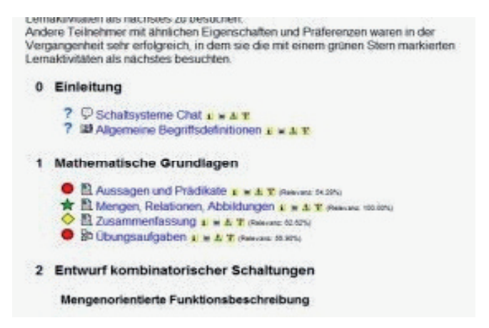
Figure 2: Course content design in a links annotation system

The iLMS module is an addition to the Moodle system. From the technical point of view, the module contains a new adaptive course format (the format complements the traditional course formats, the thematical and weekly ones) and some blocks for creating adaptive content in LMS Moodle.