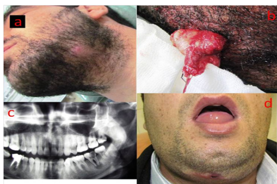
Figure 3. a, Erythema and alopecia of the skin in the submandibular region. b, Enucleated lesion. c, Panoramic view of the jaws showed a carious mandibular second molar with a periapical lesion. d, Submental swelling with persistent fistula.