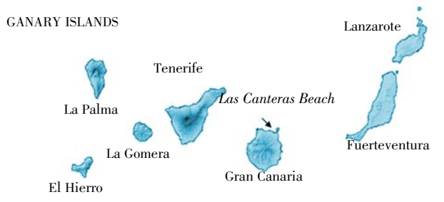
Figure 1. Map indicating Las Canteras Beach at Gran Canaria (Canary Islands, Atlantic Ocean).

Canary Islands are located near the Northwest African coast, and are composed by seven islands and several islets (Figure 1). Las Canteras Beach is located on the north-eastern coast of Gran Canaria island (28°08'24.32" N 15°26'15.43" W, Figure 1) and sheltered from the prevailing north-eastern winds and swells by a rocky bar of volcanic origin. Detailed descriptions of the study area are reported by Martínez-Martínez et al.[15] and Alonso and Vilas<sup>[16]</sup>. The monitoring of the seagrass meadow at Las Canteras Beach (Figure 1) was carried out during July-August 2005 by a diver along eleven transects distributed in the stretch of North Las Canteras, the most protected area due to the presence of the largest part of the bar and of the northern headland. Two transects parallel to the coast were also traced close to the rocky bar and in the middle distance between the bar and the beach. Random observations were carried out by covering the total extent of the beach, in order to verify the possible distribution of the seagrass in areas not covered by transects. The results obtained on the distribution were compared with those reported by González and Pavon-Salas et al[12,13]. The depth was recorded by a log dive computer (ALADIN Pro, UWATEC). All measurements were recorded in the field without using destructive methods.