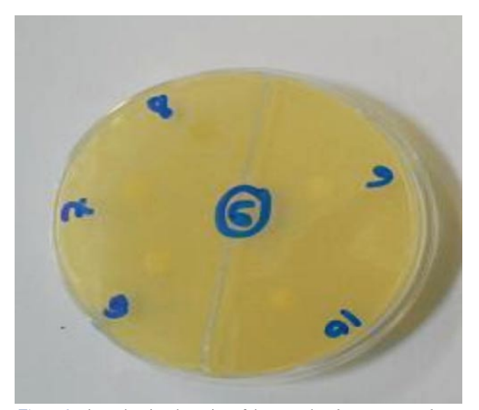
Figure 2. Plates showing the action of the two salt solutions on E. coli (6 & 8: Piper young salt; 7 & 9: Piper mature salt; 10: sodium chloride (control sample).

The mineral intake of both the solids was calculated and compared with the recommended daily intake (RDI) (Table 5). Carbon was found to be exceedingly high for the ash suspension.