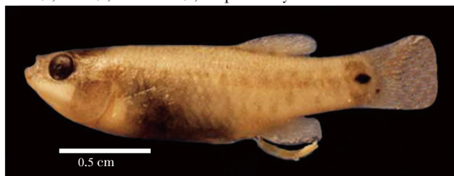
Figure 1. Infected female of A. sophiae .

The total mean length of examined fishes was 22.7–43.1 mm and out of 70 fish, two females were infected by three Lernaea sp. that one parasite was attached firmly to the base of anal fin in one fish (Figure 1 and 2) and two Lernaea parasites were attached to the base of pectoral fin and abdomen of other infected fish. The prevalence, intensity and abundance are 2.850%, 1.500%, and 0.043%, respectively.