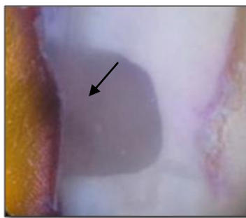
Figure1. Illustration of specimen with no leakage (Score0)

* The level of significance was considered at p<0.05