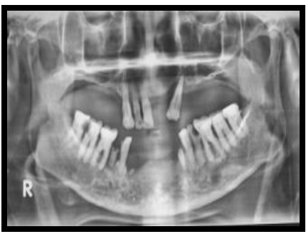
Fig 4: orthopentomogram showing erosion of left tuberosity region