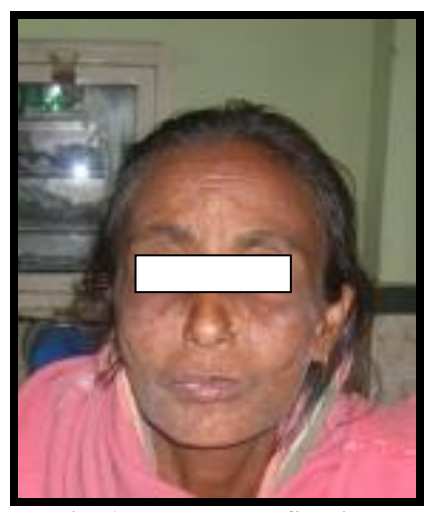
Fig: 1 extra oral profile view

A 70-year-old woman, reported with a chief complain of swelling on her palate from two months. Intraoral examination reveals a firm movable, painful, sub-mucosal mass of 2.0 cm in the widest diameter and located on the left side on the hard palate. Overlying mucosa was intact and of normal colour and texture. Panoramic and standard occlusal view X-ray showed some signs of bone destruction. However, the lesion caused slight elevation of the floor of the left nasal cavity.