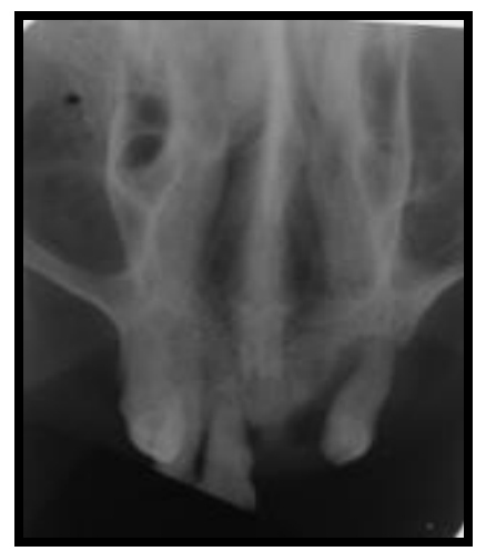
Fig3: intraoral x-ray