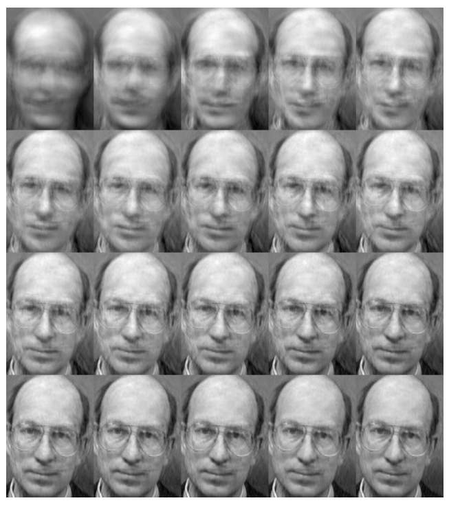
Fig 3. Eigen Faces

Eigen face approach [3] is one of the earliest appearance-based face recognition methods. This method utilizes the idea of the principal component analysis and decomposes face images into a small set of characteristic feature images called eigenfaces as shown in Fig 3 [7]. There are a variety of approaches for face representation, which can be classified into three categories: template-based, feature-based, and appearance-based.