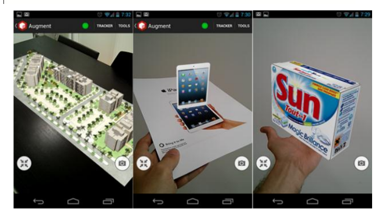
Figure 5 Augmented reality application in mobile apps.

Augmented reality brings virtual experiences to the user from the physical world. This kind of approach is called MES (Multi-sensory, Emotional, and Sharing) approach. Multisensory stimulates sense in order to deliver information to users. In this case, augmented reality can accommodate audio and visual stimulus in order to give emotional bound information to the users. When the users processes the information emotionally, they will share the experience they have gained to other users unconsciously.