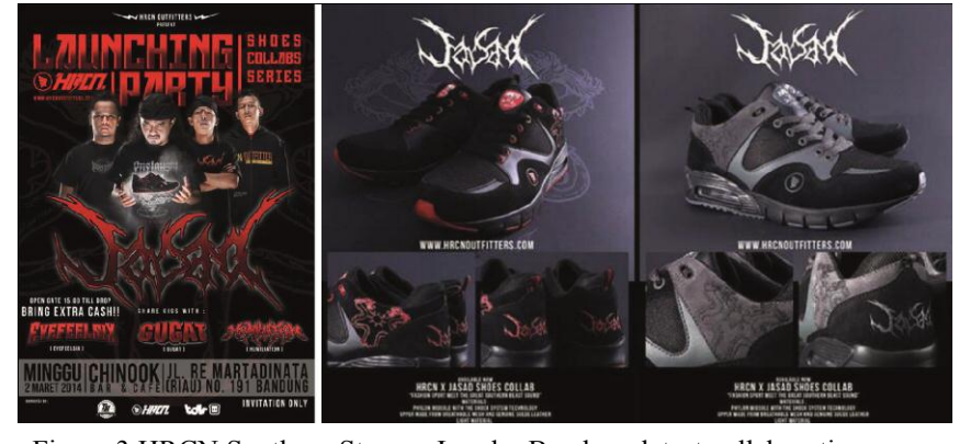
Figure 3 HRCN Southern Stone x Jasad – Bandung latest collaboration. (https://twitter.com/Jasad_bdm)

From this information above, it can be concluded that augmented reality can make the physical world more informative, effective, binding, and can be easily remembered.