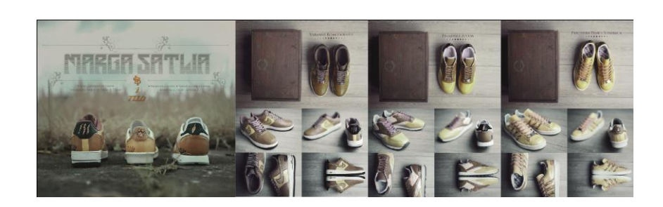
Figure 2 IST and SevenZulu custom shoes collaboration. (http://blog.ist.web.id/)