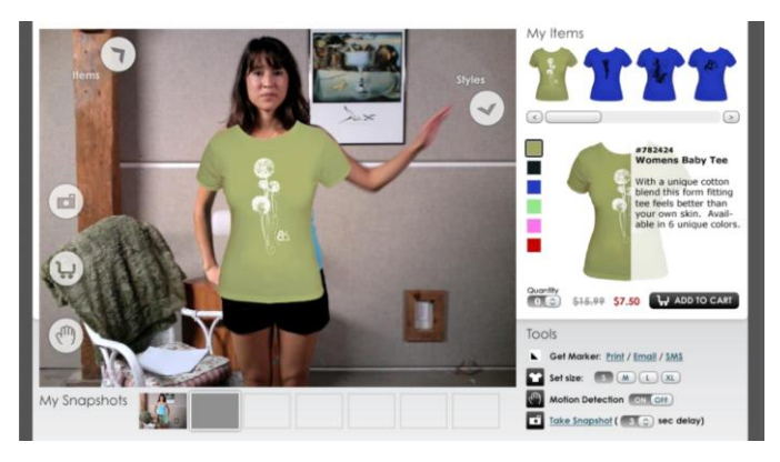
Figure 7 An example of augmented reality in e-commerce website. (http://www.adstuck.com/)