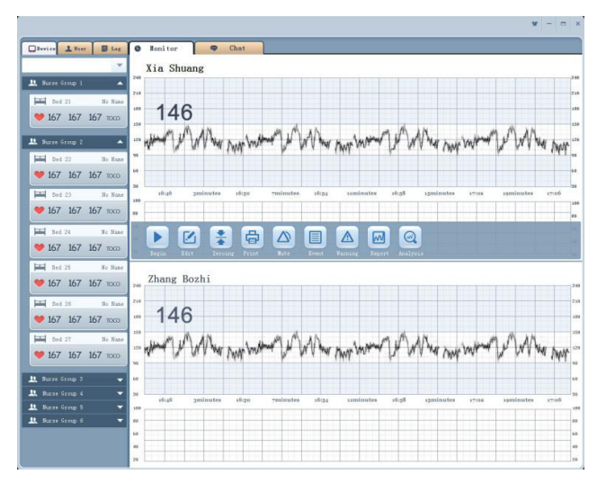
Fig. 3 Screen shot of Monitor Activity