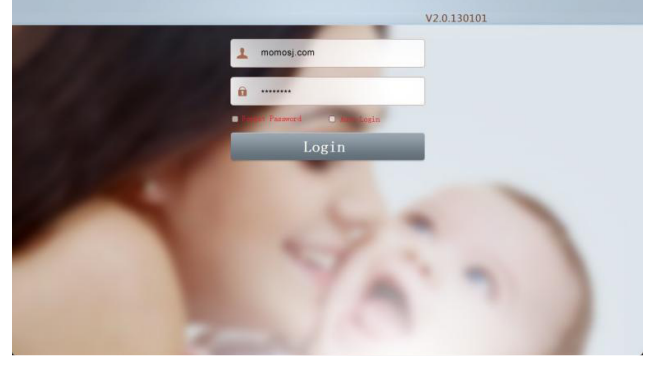
Fig. 2 Screen shot of Login Activity