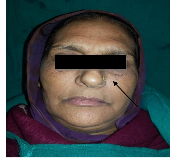
Fig. 1: Extraoral picture showing swelling on left lower side of face

The overall features were suggestive of odontogenic keratocyst. So final diagnosis of odontogenic keratocyst wrt left lower molar – ramus area was given. The patient was followed up after one month and the healing was found to be satisfactory with no tendency for recurrence.