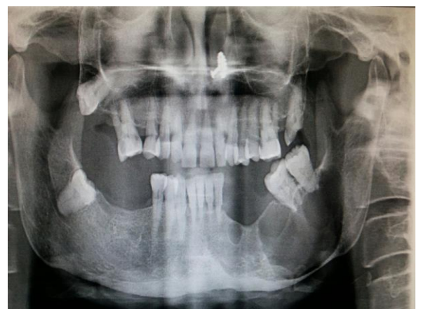
Fig. 5: OPG which showed a well-defined radiolucency was present wrt left lower molar – ramus area which was oval in shape with well-defined corticated borders and internal septae was present giving it a multilocular appearance