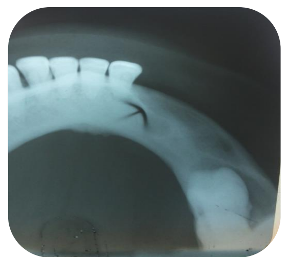
Fig. 4: Mandibular occlusal topographic radiograph which revealed normal anatomic landmarks and missing teeth 33,34,35,36