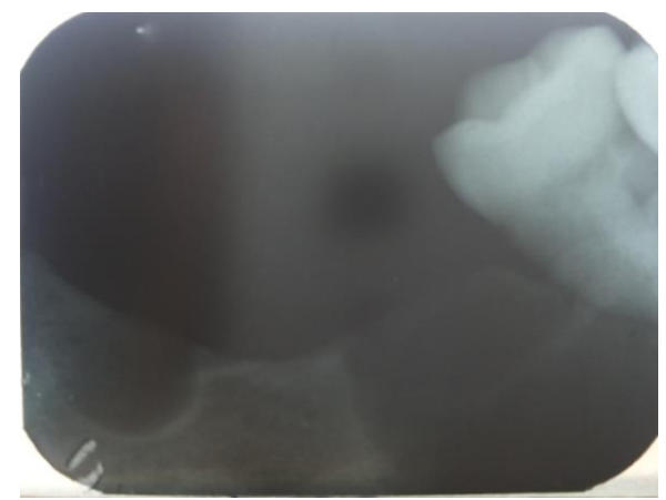
Fig. 3: IOPA wrt 35, 36, 37 which showed a radiolucency that extends anteriorly from 35 tooth region posteriorly upto mesial aspect of 37 tooth region