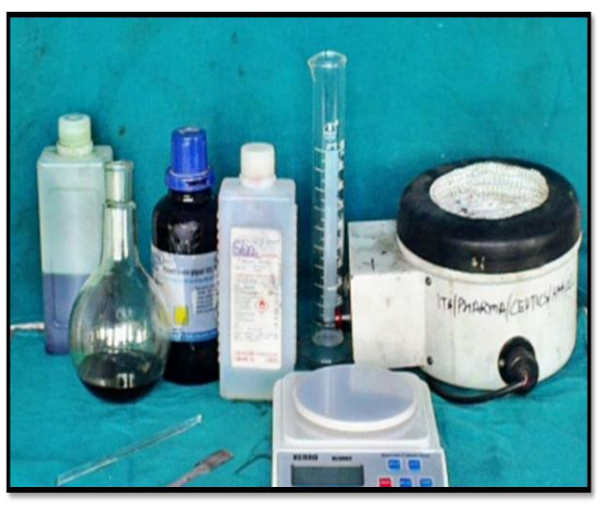
Fig. 1: Armamentarium for preparation of 4% Ocimum sanctum extract

Patients were evaluated after 30 days interval. Periodontal assessments were performed using the Plaque Index using (Turesky Gilmore Glickman modification of Quigley Hein Plaque Index, 1970)<sup>19</sup>, Gingival Index (Loe & Silness, 1963)<sup>20</sup>, Probing Depth and Clinical Attachment Level were measured using UNC 15 probe.