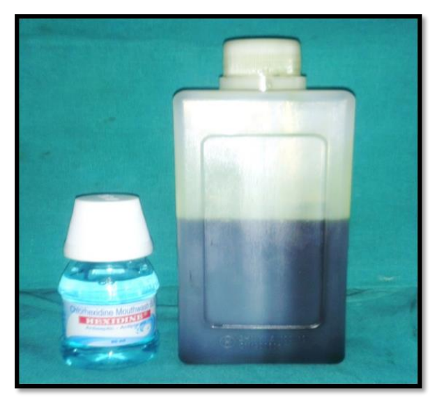
Fig. 2: 0.2% Chlorhexidine gluconate and 4% Ocimum sanctum extract