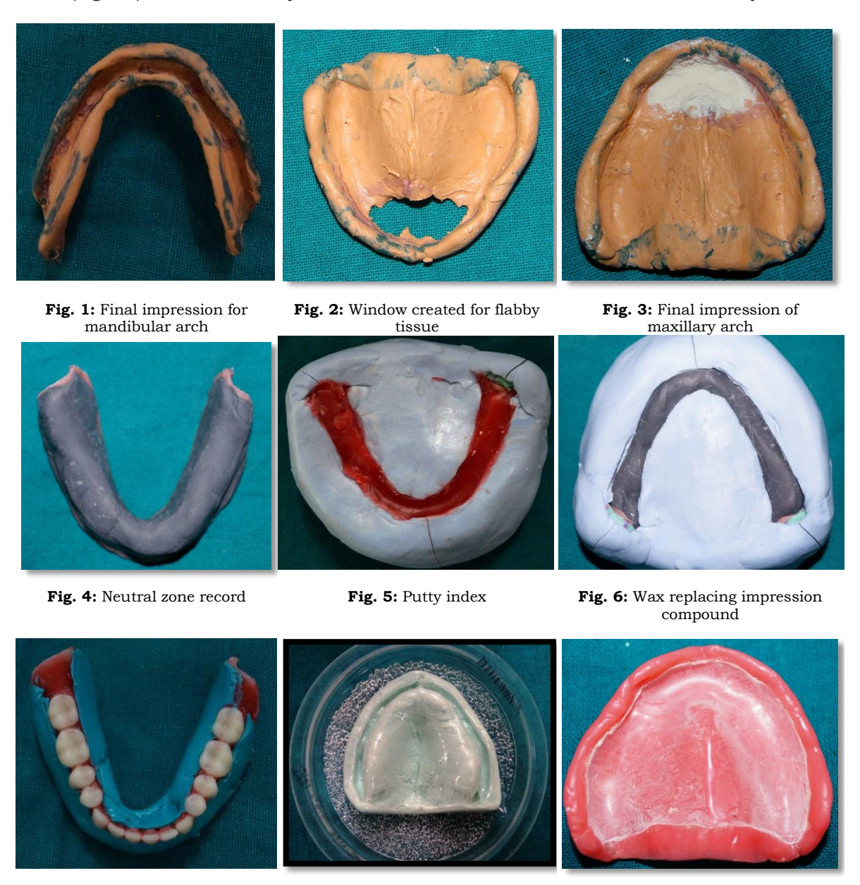
Fig. 8: 1.5mm bioplast sheet

sheet was marked on the cast. Another sheet of 0.5mm thickness was adapted over this cast (Fig. 11). Earlier adapted sheet of 1.5mm thickness was carefully separated from denture and latter is adapted to create a space of 1.0mm for liquid. The junction of the sheet and the acrylic was carefully sealed with the help of light cure acrylic. Two holes were made in the distobuccal region on maxillary denture and glycerin was injected through these inlets (Fig. 12). They were closed with light cure acrylic resin. Denture was checked for any sharp points, roughness and leakage. Follow up of patient was done after 24hours to check for any soreness.