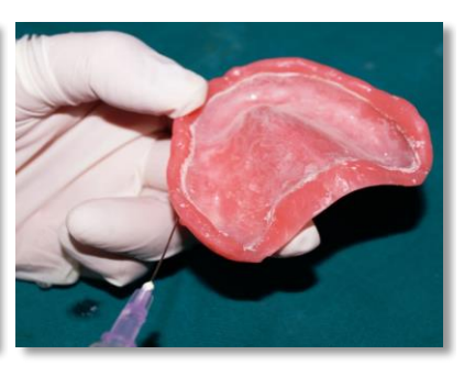
Fig. 12: Injecting glycerin