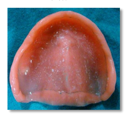
Fig. 13: Maxillary final impression