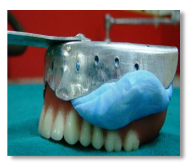
Fig. 10: Silicone impression of tissue side