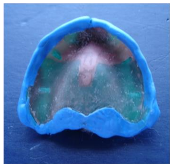
Fig.2: One step border molding using heavy bodied elastomeric material - polyvinyl siloxane

3. One step border molding using modified zinc oxide eugenol impression paste: modified zinc oxide impression paste was used for border molding. The filler content was increased to add to the bulk of the paste and amount of catalyst was also increased to allow faster setting of the material. The base paste and the catalyst paste were dispensed onto a glass slab and mixed with a spatula. The mixed paste was then loaded into a 5 cc syringe and syringed onto the tray borders and border molding was accomplished by manual manipulation as described earlier.[Fig.3]