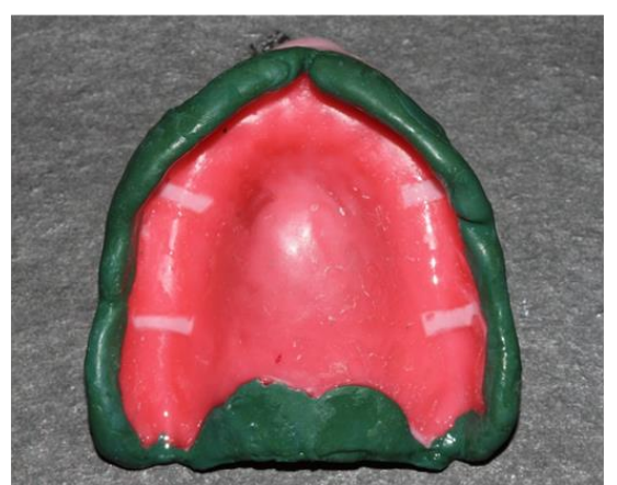
Fig.1: Border molding using low fusing impression compound type i b

1. One step border molding using low fusing impression compound type i b: low fusing impression compound type i b available in the form of stick was finely powdered using a mortar and pestle. A 5cc syringe was then filled with the powdered compound. The compound was then softened by placing the syringe into a water bath with temperature maintained at 80°C.6 The softened compound was then syringed onto the borders of the tray .Border molding was accomplished by manual manipulation of the soft tissue adjacent to the borders to duplicate the contour and size of the vestibule.[Fig.1]