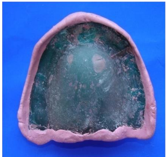
Fig. 3: One step border molding using modified zinc oxide eugenol impression paste

3. One step border molding using modified zinc oxide eugenol impression paste: modified zinc oxide impression paste was used for border molding. The filler content was increased to add to the bulk of the paste and amount of catalyst was also increased to allow faster setting of the material. The base paste and the catalyst paste were dispensed onto a glass slab and mixed with a spatula. The mixed paste was then loaded into a 5 cc syringe and syringed onto the tray borders and border molding was accomplished by manual manipulation as described earlier.[Fig.3]