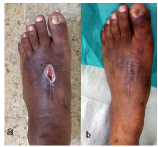
Fig. 4: Wound dehiscence (a) and healing by secondary intention (b)