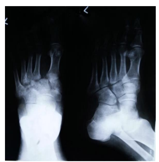
Fig. 2: Present radiograph of displaced injury