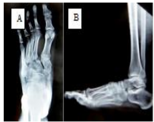
Fig. 1: Initial radiograph showing the 'fleck sign' suggestive of Lisfranc's joint injury that was missed

wound allowed healing successfully with secondary intention after three weeks (Fig. 3b). A supervised physiotherapy of ankle and toes ensured early return of pain free range of motion.