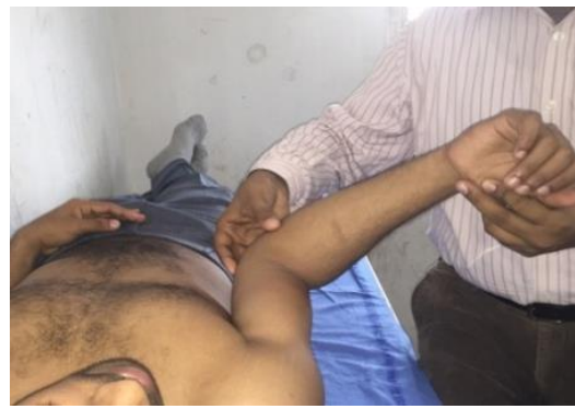
Figure 3. External rotation