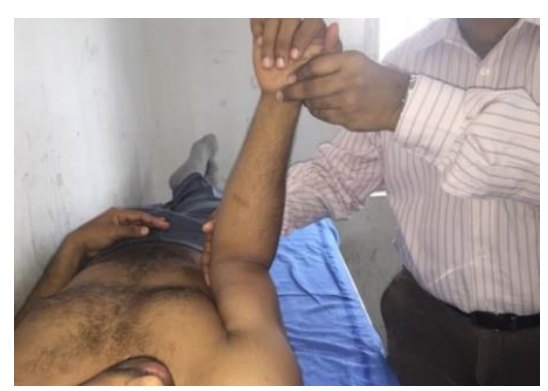
Figure 2. Adduction of arm