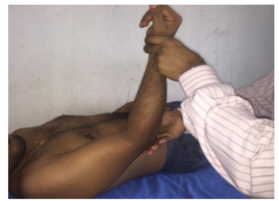
Figure 1. Flexion of elbow and flexion of shoulder

Shoulder is immobilsed for a week, followed by pendulum exercises as the patient is able to tolerate. Isometric shoulder strengthening exercises are started from 3 rd week along with active and passive shoulder mobility exercises as patient tolerates. External rotation and abduction over 90° strictly avoided for a minimum of 4 weeks. Shoulder strengthening and mobility exercises continue till shoulder movements restored under physiotherapist.