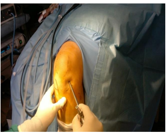
Arthroscopic Guided Reduction of Fracture

There have been many options for the treatment of tibial plateau fractures in orthopaedic literature including conservative treatment, external fixation, open reduction-internal fixation (ORIF) and arthroscopic assisted osteosynthesis.<sup>6</sup> The ultimate goal of the intra-articular fracture treatment should be the precise restoration of the joint surface and rigid fixation to allow immediate postoperative non-weightbearing exercises.<sup>3,6</sup> The difficulty in achieving precise reduction using conservative methods and the higher morbidity associated with traditional surgical methods have led to the development of semi invasive techniques.<sup>3,7</sup> The treatment of tibial plateau fractures with arthroscopic assisted osteosynthesis is one method that is associated with lower morbidity, less extensive surgical dissection.<sup>3,8,9</sup> Furthermore, arthroscopy allows the surgeon to diagnose and treat concomitant intra-articular injuries.<sup>3,10,11</sup>