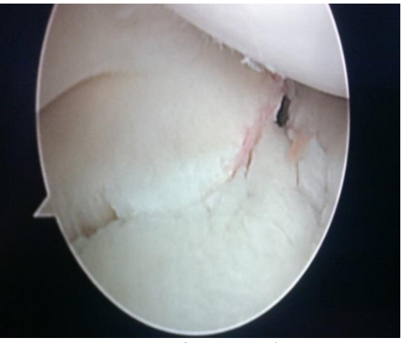
Fracture after Reduction