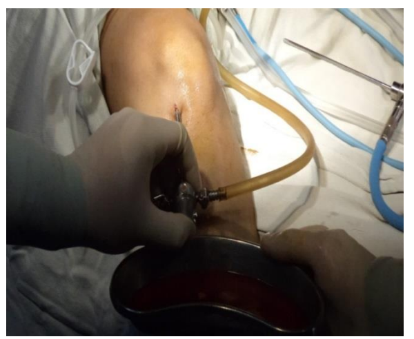
Initial Haemarthrosis Drainage

Tibial plateau fractures have always been a challenge for orthopaedic surgeon. Like other intraarticular fractures, regaining pre-injury functional status in the tibial plateau fracture is challenging for orthopaedic surgeons because of its severity of associated soft tissue injuries trauma. and postoperative stiifness.<sup>1</sup> Traditional surgical methods achieve satisfactory results in 70-80% of cases however, these methods have a high incidence of complications including loss of reduction, infection, and septic arthritis.<sup>1</sup> The goals of treatment are restoration of normal alignment, joint congruity, joint stabilization and, ultimately, the prevention of degenerative osteoarthritis.<sup>2,3,4,5</sup>. This is further facilitated if soft tissue damage can be kept to a minimum degree. Open reduction and internal fixation have a high incidence of soft tissue problems, while plaster cast immobilization produces higher joint stiffness and deep vein thrombosis rate.