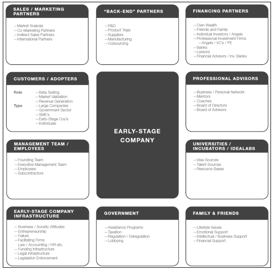
Figure 2. The early-stage company eco-system

4. Decision environment . All the activity related to figure 1 occurs within the context of a broader early-stage company eco-system (figure 2).