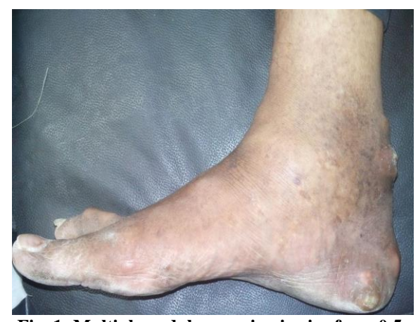
Fig. 1: Multiple nodules ranging in size from 0.5-2.5cm diameter, firm and mobile, non-tender. (Inset showing closer view of nodules)

FNAC was performed from all the three sites using a 23-gauge needle. The aspirate was white, chalky granular in nature. Papanicolaou (Pap) stained smears demonstrated chronic inflammatory infiltrate, abundant granular amorphous, retractile deposits on scanner view and on high power view it showed scattered stacks and sheaves of slender needle shaped crystals. [Fig. 2] Polarizing microscopy of the same smears showed birefringent crystals, consistent with monosodium urate (MSU) crystals [Fig. 3 and 4]. Diagnosis of gouty tophi was given on the basis of cytomorphological features. Following this report patient was investigated for serum uric acid which was found to be raise 10.4mg %.( Normal Range 3.5-7.7mg %).