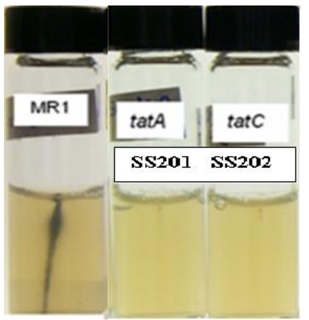
Figure 1: Qualitative sulfite reduction by S. oneidensis strains. SO_3 reduction is detected by the formation of FeS (black precipitate) as evident in the wild type strain MR-1. Strains and SS202 strains with transposon insertion in tatA and tatC genes respectively appear to be deficient in sulfite reduction.