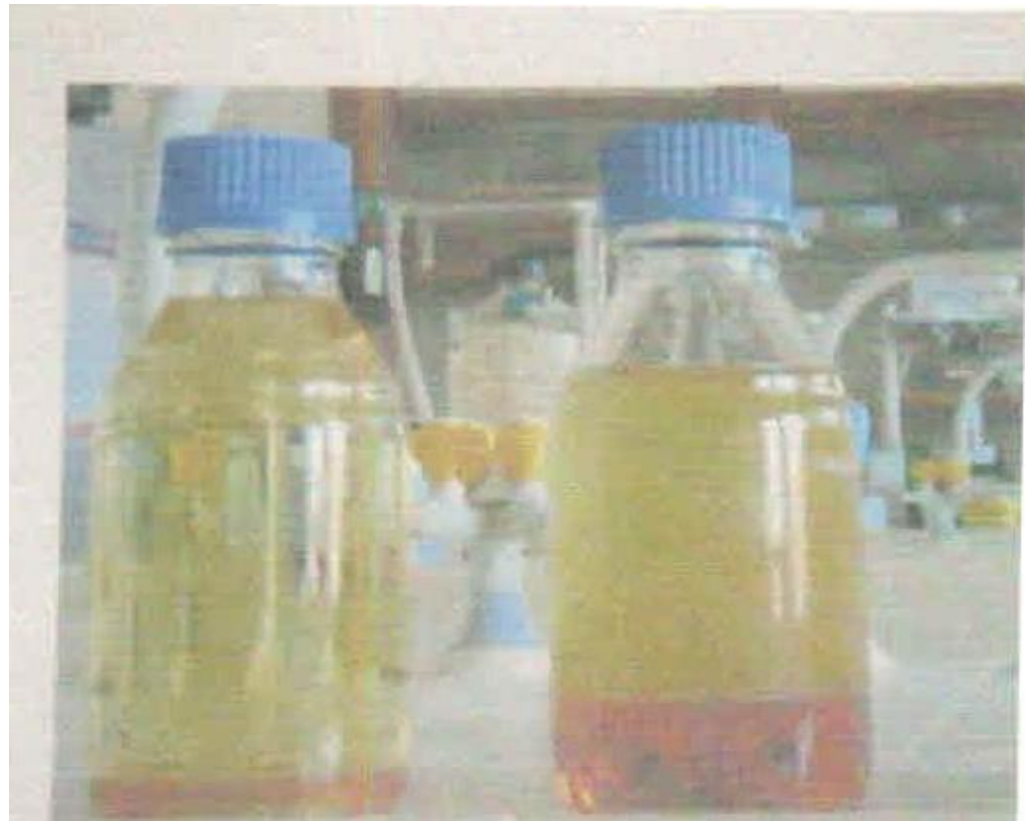
Erythrocyte Haemolysis Method