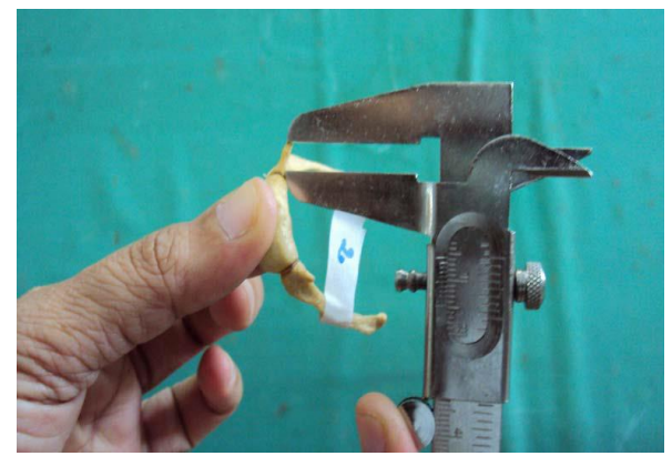
Figure 4: Measurement of length of lesser cornu