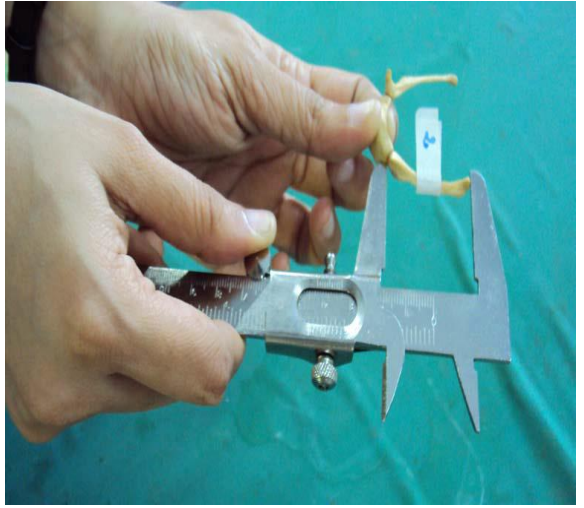
Figure 2: Measurement of length of greater cornu