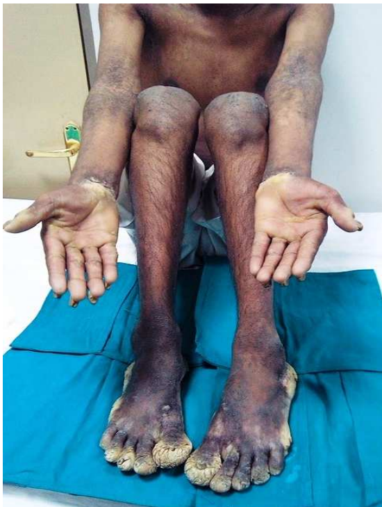
Figure - 2: Bilateral involvement of soles with thickened, macerated and yellowish skin.

Figure - 1: Hyperkeratotic lesions over the flexor of elbow and knee joints.