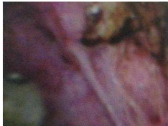
Figure – 1: Surgical photograph showing DIE.

The woman is under our follow up the ureteral stent removed and left hydroureteronephrosis cleared. HPE of the tissues reported as endometriosis. (Figure – 1, 2, 3, 4, 5)