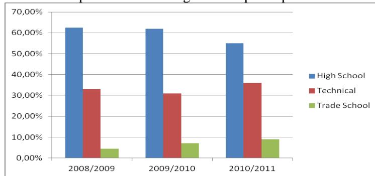
Figure 1. School choice decisions are presented as a percentage by 18 high school students in 2008-2011

For technical school students decide to presumably examinee realize what direction should follow their professional development. Students who decide to vocational school, you probably are aware of his decision and want to complete your education in a learned profession and begin the acquired profession.