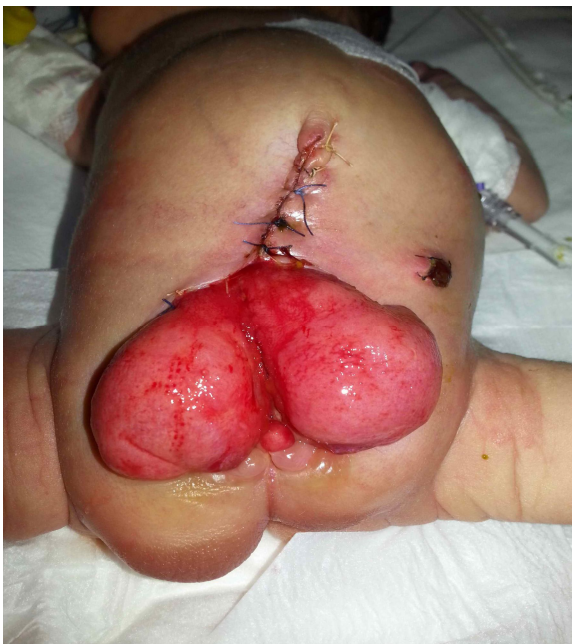
Fig. 3. The postoperative photo showing the repaired abdominal wall defect, the classic bladder exstrophy created by approximating of the bladder halves in midline, and end colostomy.

urogenital reconstruction along with pelvic osteotomy at least 3–6 months later. The rectus sheaths on both sides in the upper part of abdominal wall defect were approximated with difficulty by figure of eight stitches and the skin was closed. Thus the appearance of classic bladder exstrophy has become, but it was protruding due to increased intra-abdominal pressure (Fig. 3).