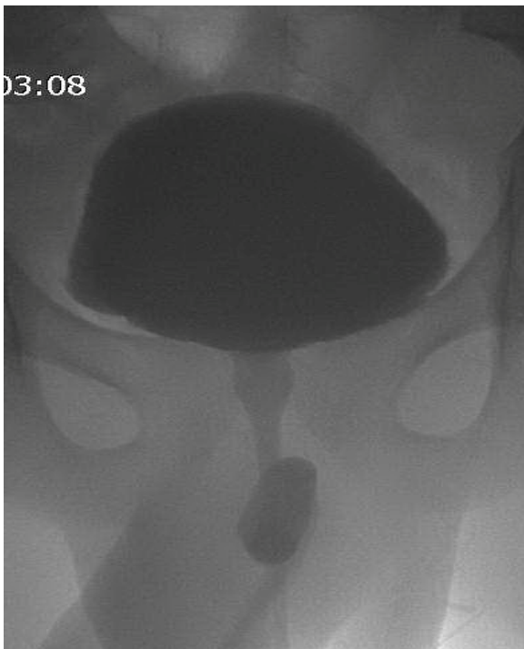
Fig. 1. RGU showing diverticulum at urethra.

A 1-year-old male child presented with a history of dribbling urine since birth, swelling on the ventral surface of penis, and recurrent urinary tract infections. Additionally, his parents noticed that he had never had a good urinary stream. The diverticulum was at the ventral surface of the mid-penile urethra and measured about 3 cm in length (Fig. 1 and 2).