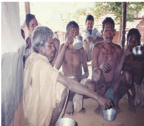
Figure 1 After Ritual Juang Drinks Handia