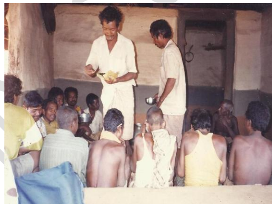
Figure 2 Decease Family Provide Rice for feast