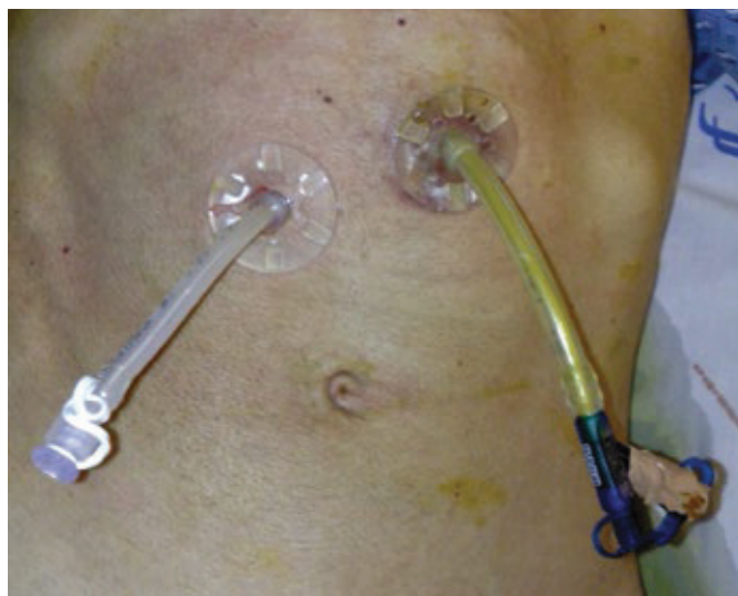
FIGURE 2. Skin view, showing a recently placed PEG drainage tube side-by-side with a previous placed feeding PEG-J. On the PEG-J, the gastric lumen is sealed with a dressing to prevent any manipulation