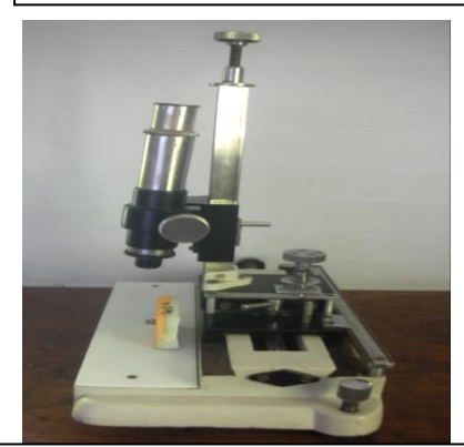
Cast Crowm In Traveling Microscope For Evaluation