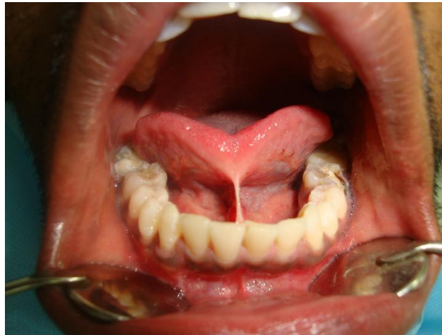
Figure 1: Pre Operative