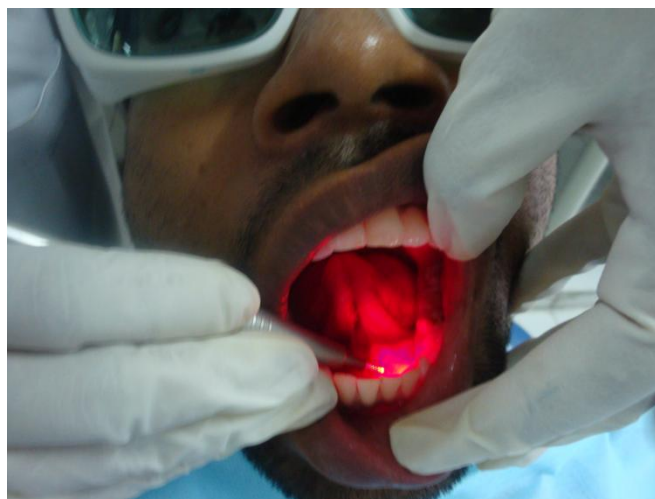
Figure 3: Excision with Lasers