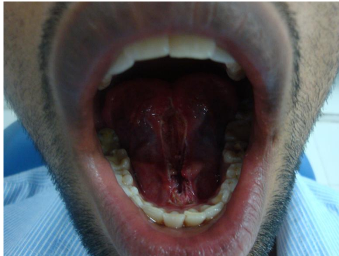
Figure 4: Immediately After Excision