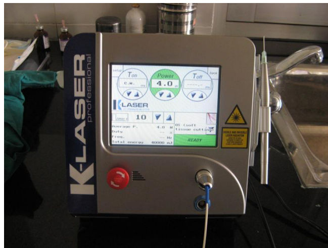
Figure 2: Diode Laser