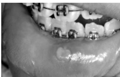
Figure 4 (a)

New braces may irritate the patient mouth and some time inserted arch wire may protrude or bowed towards cheek mucosa and cause irritation. (fig- 4 a ,4c) Non - medicinal relief wax makes an excellent buffer between metal and mouth and relieve irritation. ( fig- 4b)