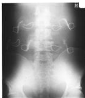
Figure 6 (a)

Few cases of accidental ingestion of appliance like broken quad helix , transpalatal arch , twin block and orthodontic wire were found. (fig -6a, 6b ) [12,13,14]. Continuous monitoring by repeated radiograph and in severe cases surgical intervention is the choice of treatment .Inhalation cause partial or complete airway obstruction. Coughing, Heimlich manoeuvre and in sever case referral to respiratory specialist should be made. Orthodontist should always check for missing appliance in each visit of patient.