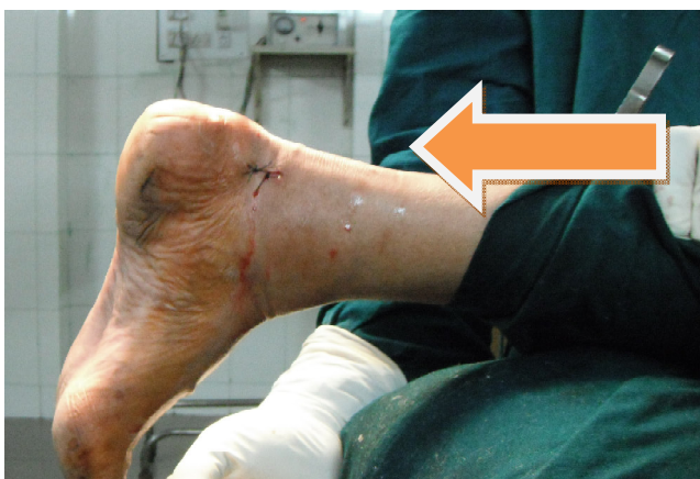
Figure 4 showing arthroscopic closure

Two portals were placed adjacent to the Achilles tendon on either side. Initially a 4-mm scope is placed through the lateral portal. With a 4-mm synovial resector the soft tissue was debrided through the medial portal on the bone side and tendon side. The Achilles tendon was protected throughout the procedure by keeping the closed end of the shaver against the tendon. The bone was resected with a mastoid burr. Both the resector and scope were interchangeably used through both the portals. After resection, the Achilles tendon was inspected through scope and confirmed to be intact. At the end of the surgery, Plantarflexion of ankle was found to be satisfactory by squeeze test. Portals were closed with 2-0 ethilon (figure4)