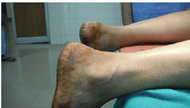
Figure 3 position on operation table

Two portals were placed adjacent to the Achilles tendon on either side. Initially a 4-mm scope is placed through the lateral portal. With a 4-mm synovial resector the soft tissue was debrided through the medial portal on the bone side and tendon side. The Achilles tendon was protected throughout the procedure by keeping the closed end of the shaver against the tendon. The bone was resected with a mastoid burr. Both the resector and scope were interchangeably used through both the portals. After resection, the Achilles tendon was inspected through scope and confirmed to be intact. At the end of the surgery, Plantarflexion of ankle was found to be satisfactory by squeeze test. Portals were closed with 2-0 ethilon (figure4)