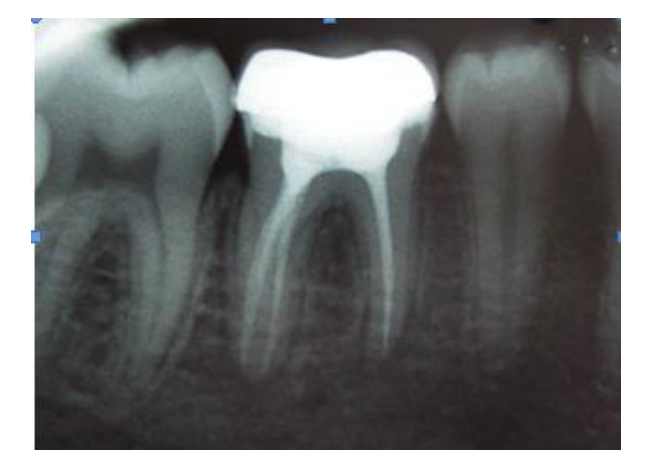
Fig 5: Post Obturation IOPA