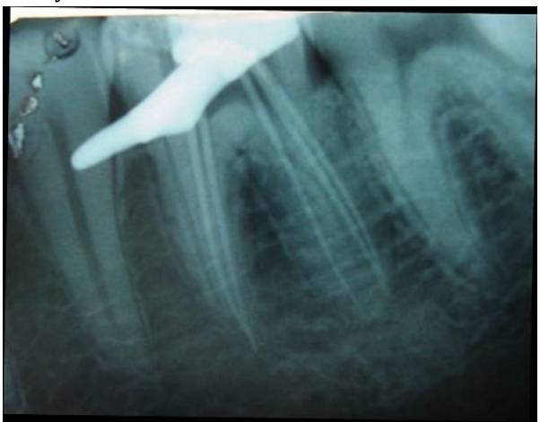
Fig 4: Showing Master cone IOPA

all the canals using hand K-files (Dentsply Maillefer) by step back preparation using copious irrigation with 2.5% Sodium hypochlorite. Master cone radiograph was taken (Figure 4). The canals were finally