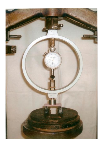
Fig 4: Universal testing machine.

Here in this study, it was found that an increase in thickness and size of steel strengtheners embedded in the acrylic resin polymer matrix enhanced the