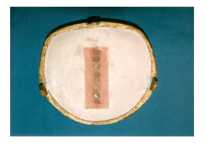
Fig 3: Placement of steel strengtheners in the mould.