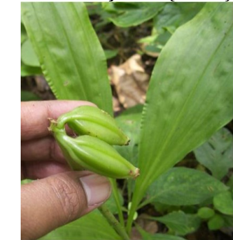
1. Geodorum densiflorum(Larnk.) Schltr.

Key identification features : Tendrilar herbaceous climber, leaves biternate & pubescent, inflorescence with basal tendrils, capsules 3-angled.