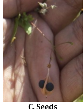
Fig.1. Photographs of Geodorum densiflorum(Larnk.) Schltr. and Cardiospermum microcarpa kunth