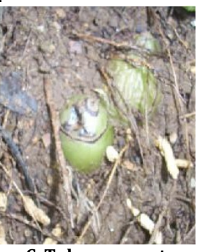
C. Tuberous root